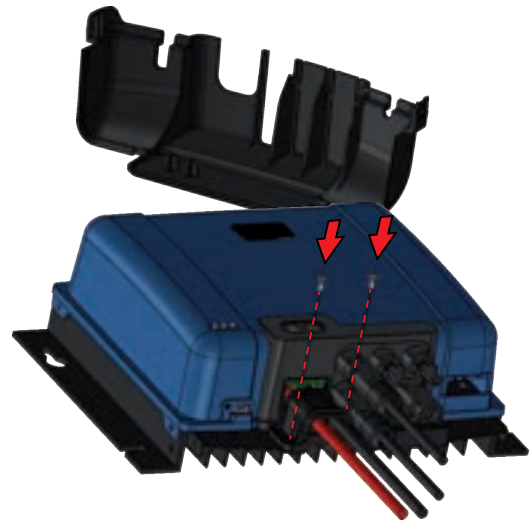
STEP 2: After mounting the MPPT to the wall, secure the cables.