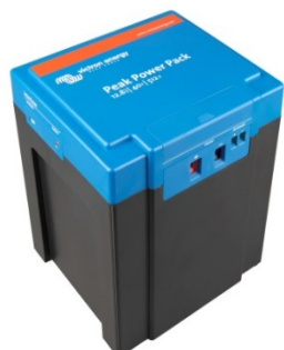
12.8 V, 40Ah