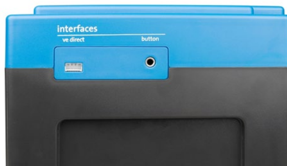
VE.Direct and push-button