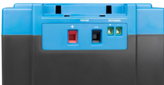
High capacity output (mover) and low capacity output (domestic)