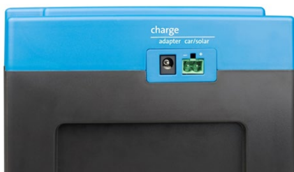
Adapter and car/solar inputs (plug for the car/solar input is included)