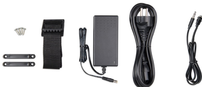
Fixing strap Adapter Power cable Push-button with cable (2m) and dual-colour LED