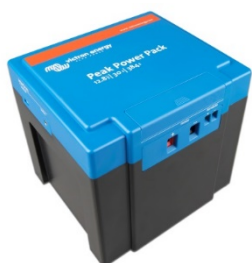
12.8 V, 30Ah