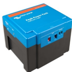
12.8 V, 20Ah