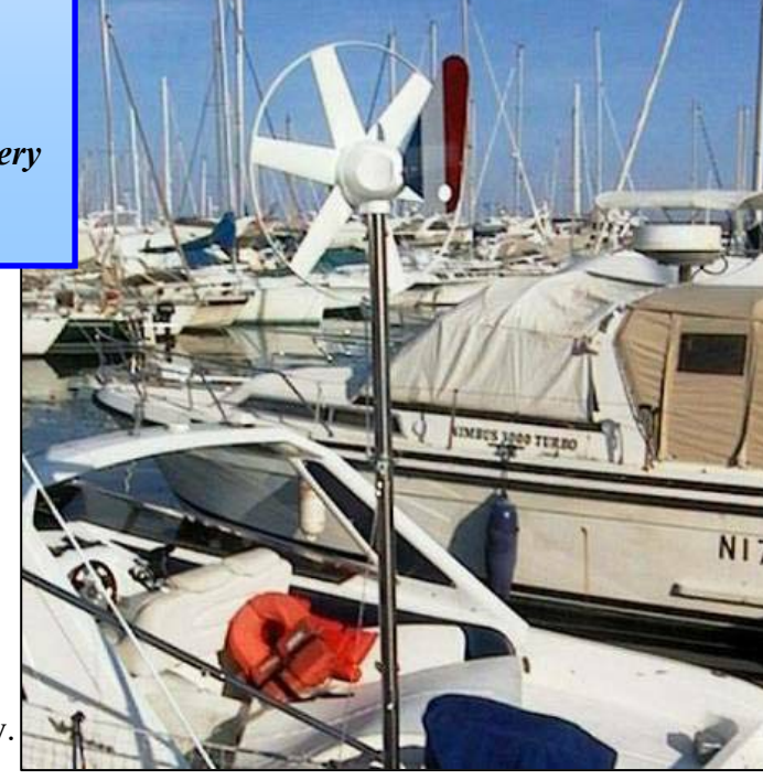
Rutland 503 keeping a motor cruiser's battery topped up and ready to start.

Modern, durable materials for reliability on the high seas accompany the very high manufacturing standards employed in our ISO9002 certified factory.