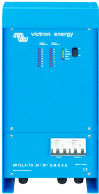
Skylla TG 24 30 GMDSS